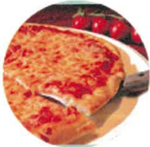
LG 16" Cheese - $18

Choose from organic tomato, savory basil pesto, and nutty asiago almond pesto.