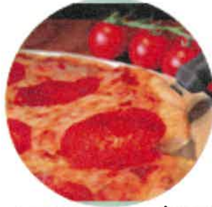
LG 16" Pepperoni - $18.50