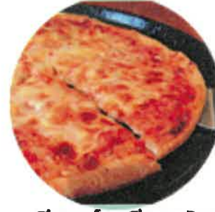
Gluten-free Cheese Party Pack Medium 12" - $39