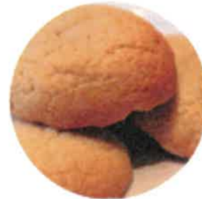
Maple Sugar - $15

www.HillsidePizza.com HILLSIDE PIZZA FUNDRAISING