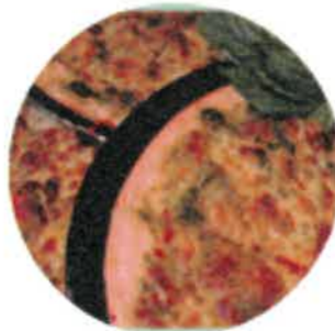
Basil Pesto Party Pack Medium 13" - $39