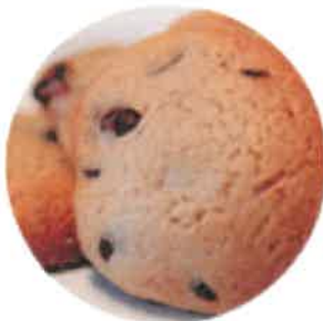
Chocolate Chip - $15

Enjoy freshly baked cookies whenever you want! Just scoop and bake for dessert, parties, or a midnight snack. Three fabulous flavors made from quality organic and natural ingredients. Each tub yields three-dozen one oz. cookies.