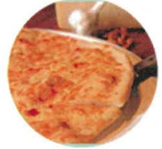
LG 16" Asiago Almond Pesto - $18.50