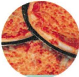
Cheese Party Pack Medium 13" - $38