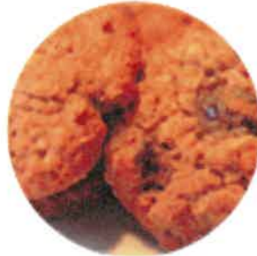
Oatmeal Raisin - $15