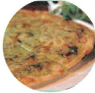
LG 16" Basil Pesto - $18.50